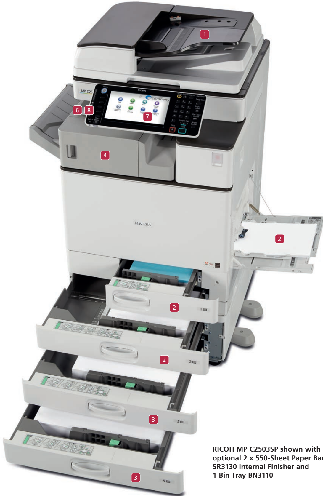
RICOH MP C2503SP shown with optional 2 x 550-Sheet Paper Bank, SR3130 Internal Finisher and 1 Bin Tray BN3110